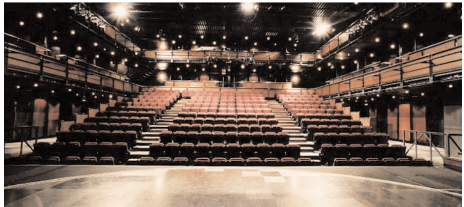
The Sala Petita of the National Theatre of Catalonia, 1997