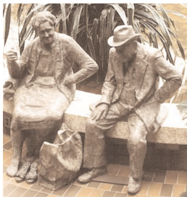
T C Douglas Building Installation