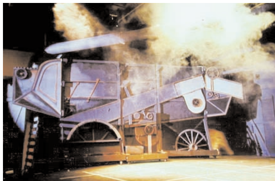
New York is Big, But This Is Biggar